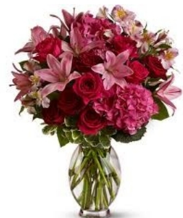
Flowers speak volumes on Valentine’s Day

Though we don’t use “floriography” in our arrangements, our flowers send a friendly greeting to Topsfield’s shut-ins.