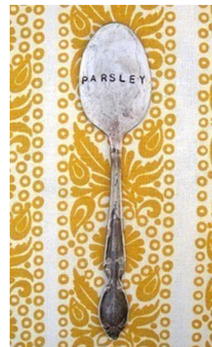
Spoon garden markers make your garden truly unique!

also make little Easter arrangements for Meals-on-Wheels.