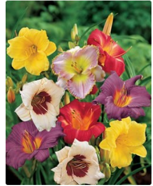
Daylilies come in endless varieties