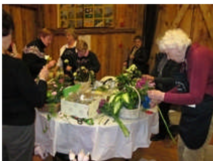
Our busy bees!