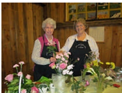
Our knowledgeable guides!