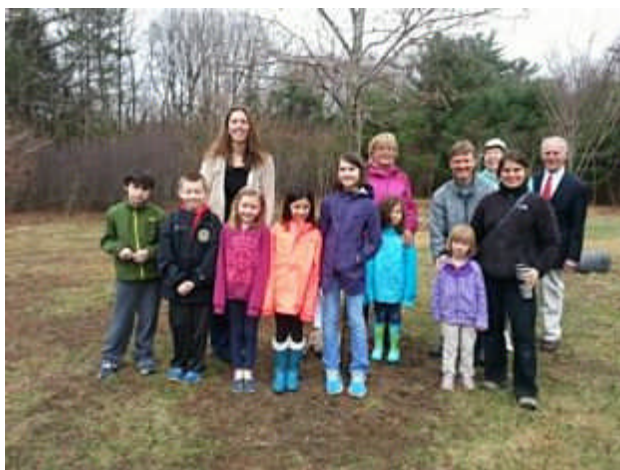
Some of the brave souls who attended!

The Arbor Day Celebration was held at the Steward School on April 17th this year. For our newer members who may not know, our club contributes funds for the tree that is planted on the school grounds each year. As you can see from the raincoats and boots, the weather was a bit of a challenge this year, and as it turned out, after the difficult winter we have just “endured,” the grounds weren’t ready for the actual tree planting. This will be done soon, and then we will know the place it is planted and the variety of tree. Stay tuned!