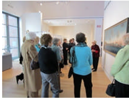
Admiring the art work with our knowledgeable Museum guide.

Great progress is being made with construction of the Caretaker's Cottage at the Parson Capon House. Soon it will be time to make plans for the garden!